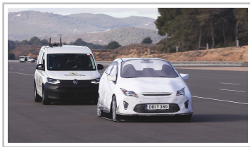
VW Caddy in the Euro NCAP test.