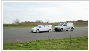
Citroën Berlingo in the Euro NCAP test.