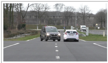
Renault Kangoo in the Euro NCAP test.