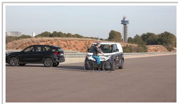
VW ID Buzz Cargo in the Euro NCAP test.