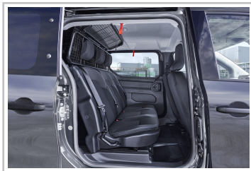
Nissan Townstar panel van double cab.