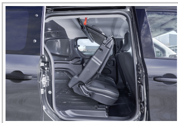
Nissan Townstar panel van double cab.