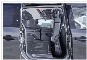
Nissan Townstar panel van double cab.