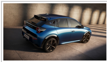
Lancia Ypsilon, special edition "Cassina".