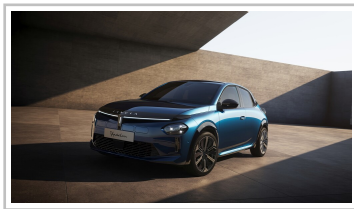
Lancia Ypsilon, special edition "Cassina".