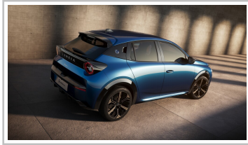
Lancia Ypsilon, special edition "Cassina".