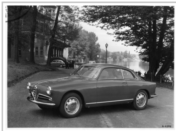
Alfa Romeo Giulietta Sprint from 1954.