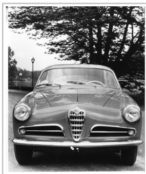
Alfa Romeo Giulietta Sprint from 1954.